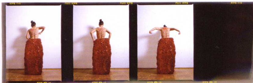
„Moderner Schmerz“, Kontaktabzug C- print, 2003, 100 x 150